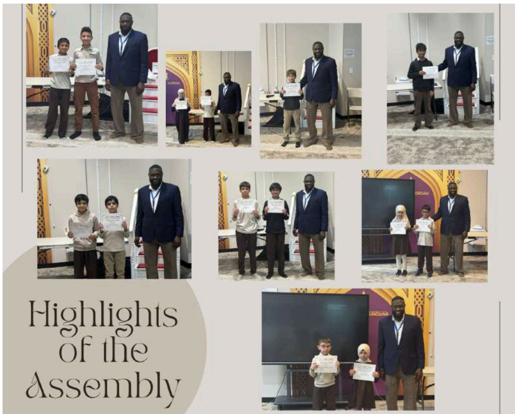
Highlights of the Assembly

The assembly served as a meaningful reminder that cooperation is essential not only for academic success but also for nurturing positive relationships and a supportive school environment.